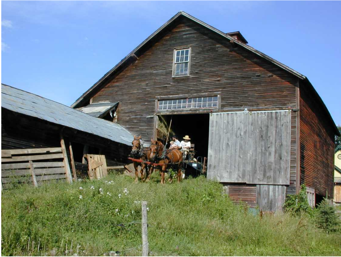
Fair Winds Farm barn, Brattleboro above and sugar house frame in Algiers (Guilford) below.