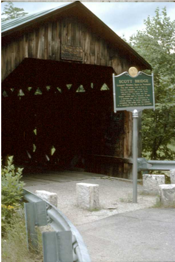
Dummerston bridge over the West River and the Scott Bridge in Townshend.