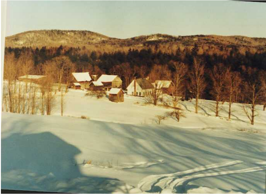
Dix farm and barns, Reading Vermont ca. 1960s.