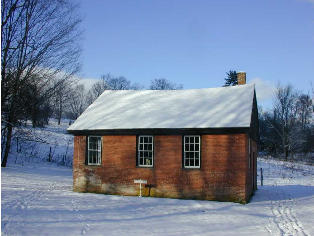
Schoolhouse in Guilford Center above and apartments in West Brattleboro below.