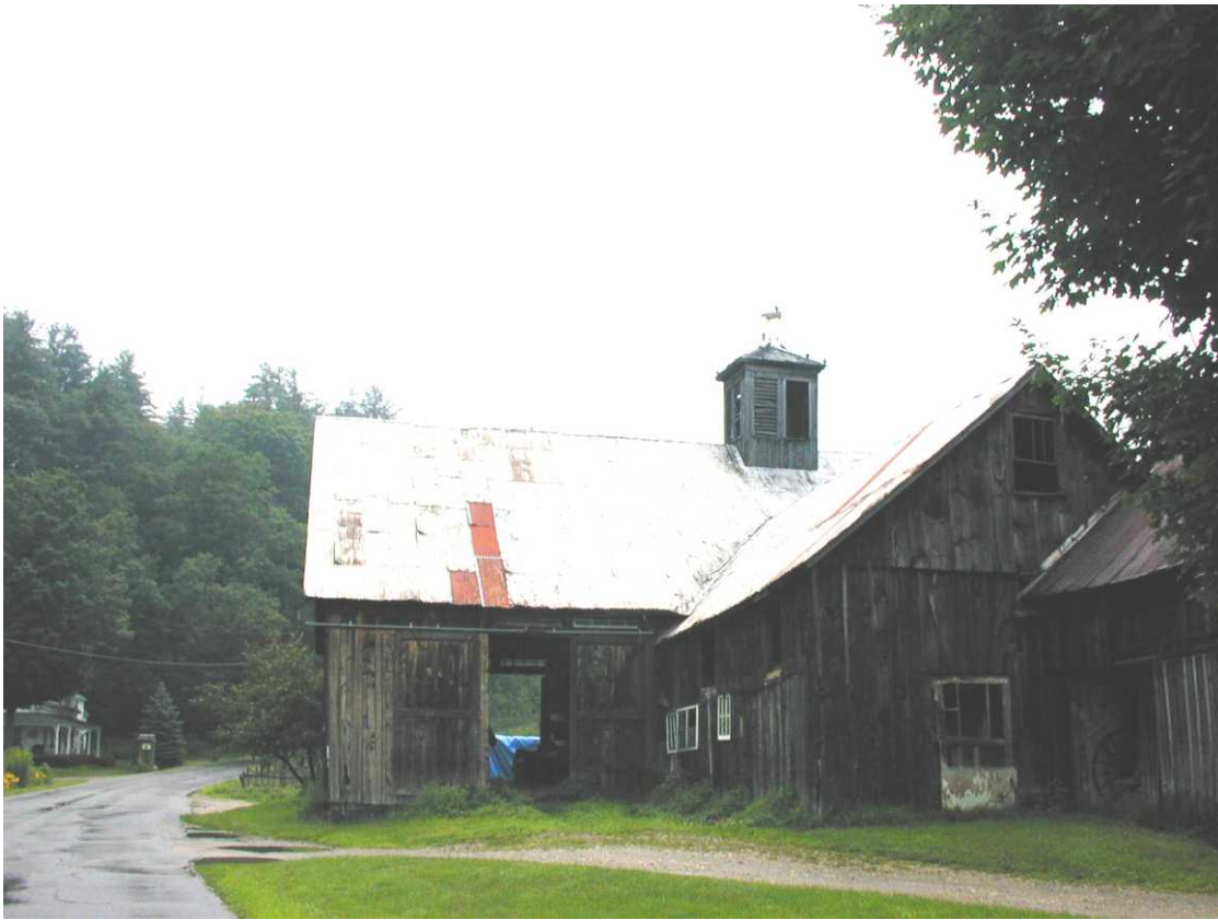
Round Schoolhouse and barn, Brookline Vermont.