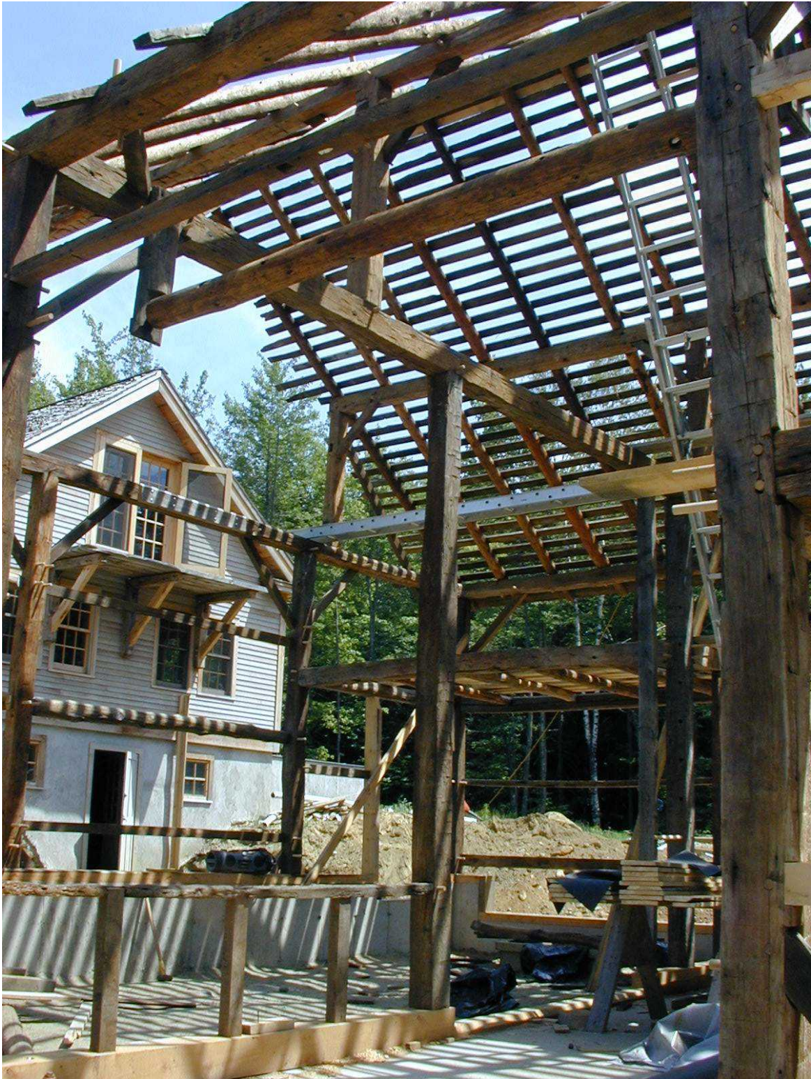
Chestnut barn frame from Vernon, Vermont being reconstructed near Marlboro Vt.