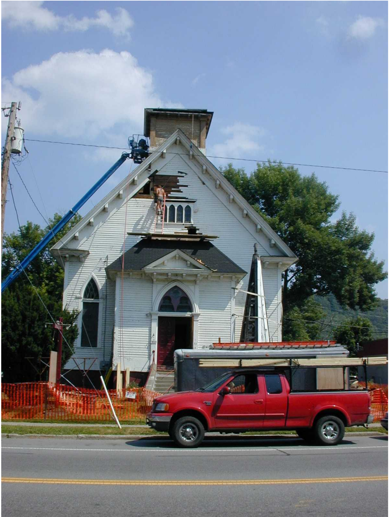
Church, Windsor, Vermont. Samples came from steeple which had been damaged by lightning.