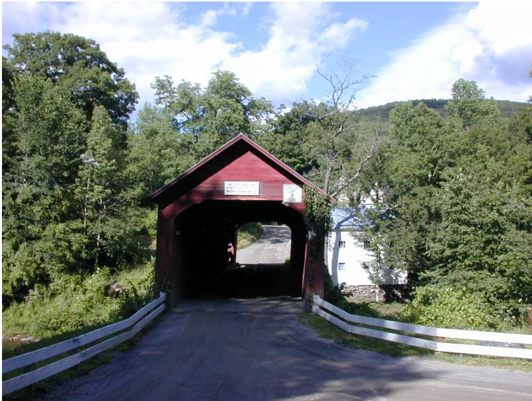
Green River Covered Bridge and Jane Seymour's house, Green River Vermont. Samples below.