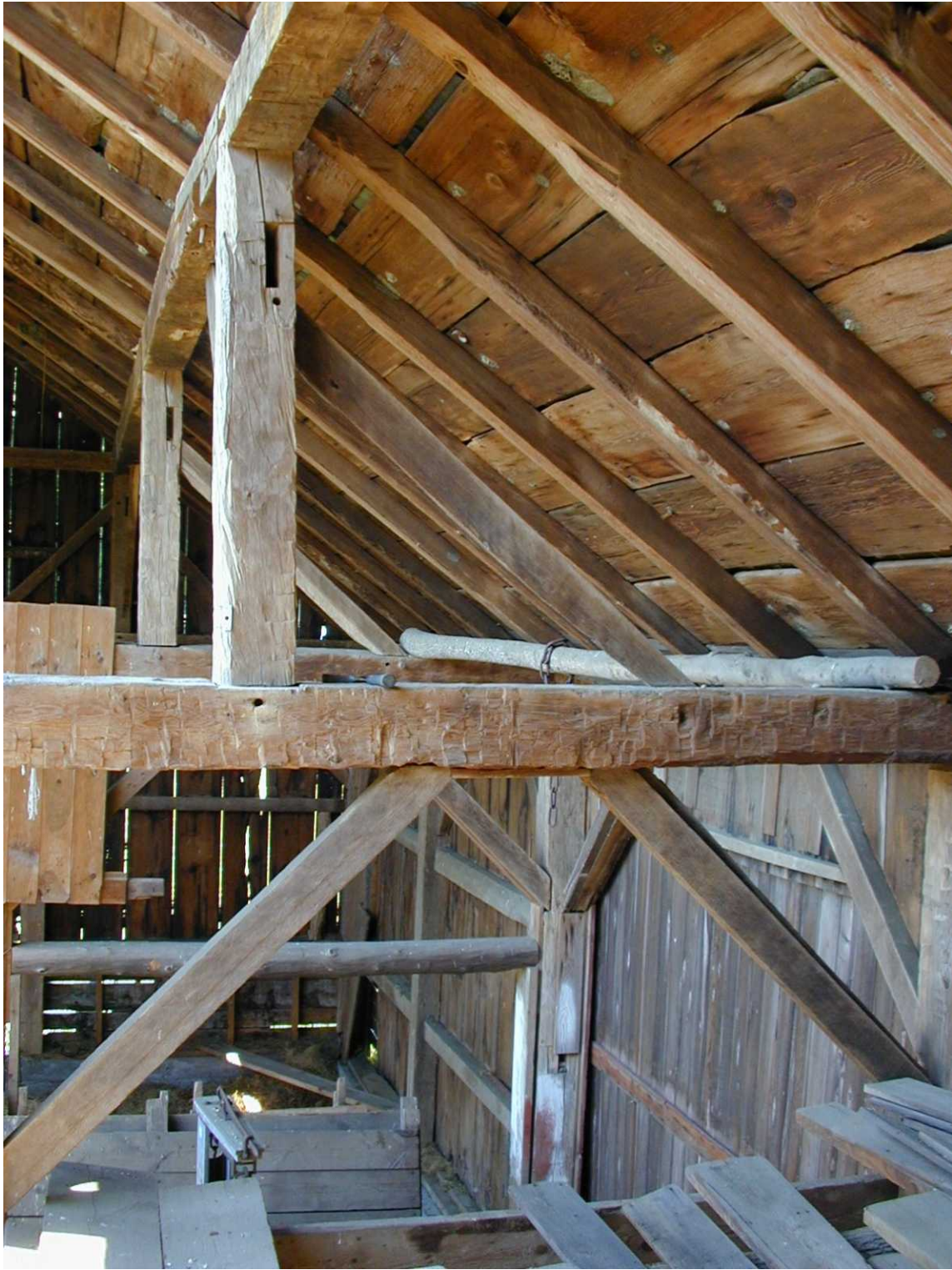
Architectural detail, Evans barn.