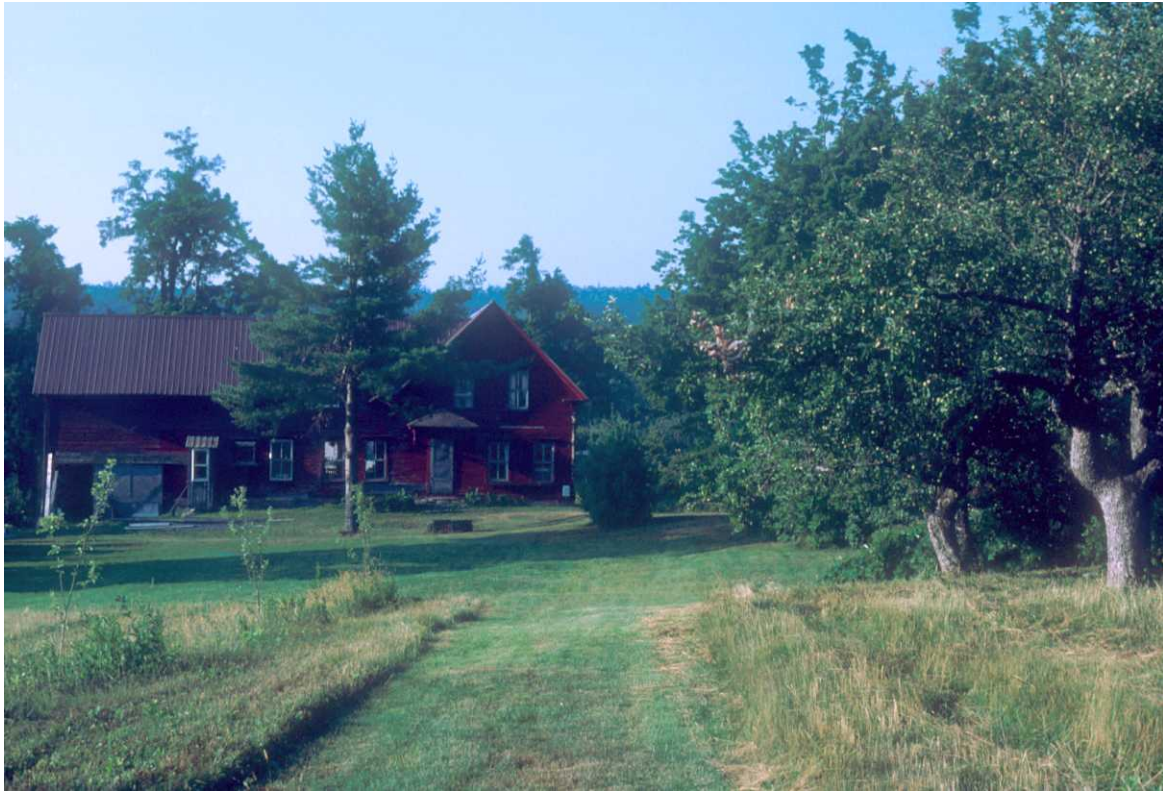
Forest Echo Farm 1880 (Mt. Holly Vermont) and Fair Winds Farm 1828 (Brattleboro).