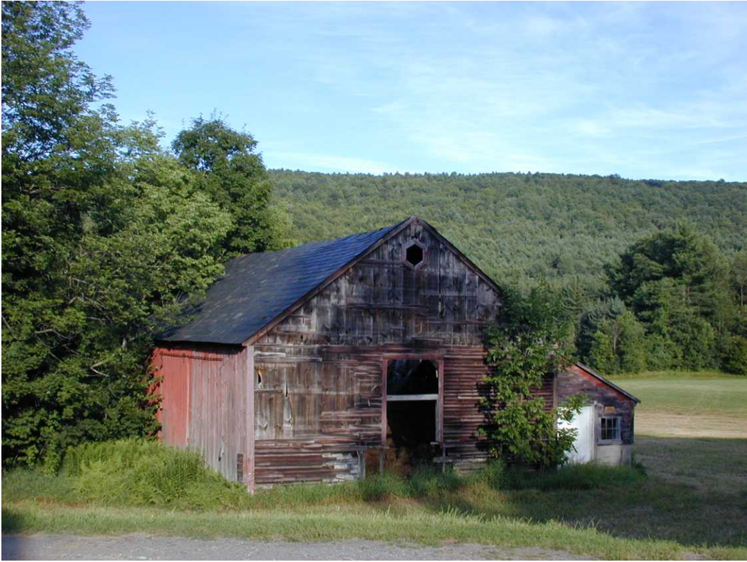
Harry Evan's barn on the Weatherhead Hollow road, Guilford Vermont. Built 1803