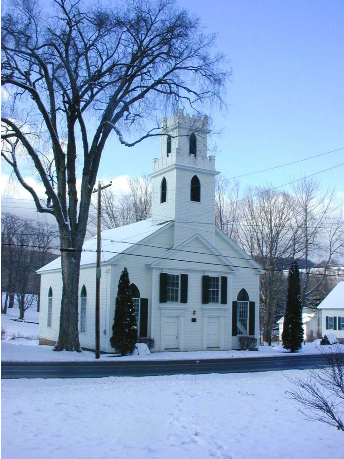
Meeting House, Guilford Center, Vermont. Samples came from roof trusses, scrap boards, and floor support posts.