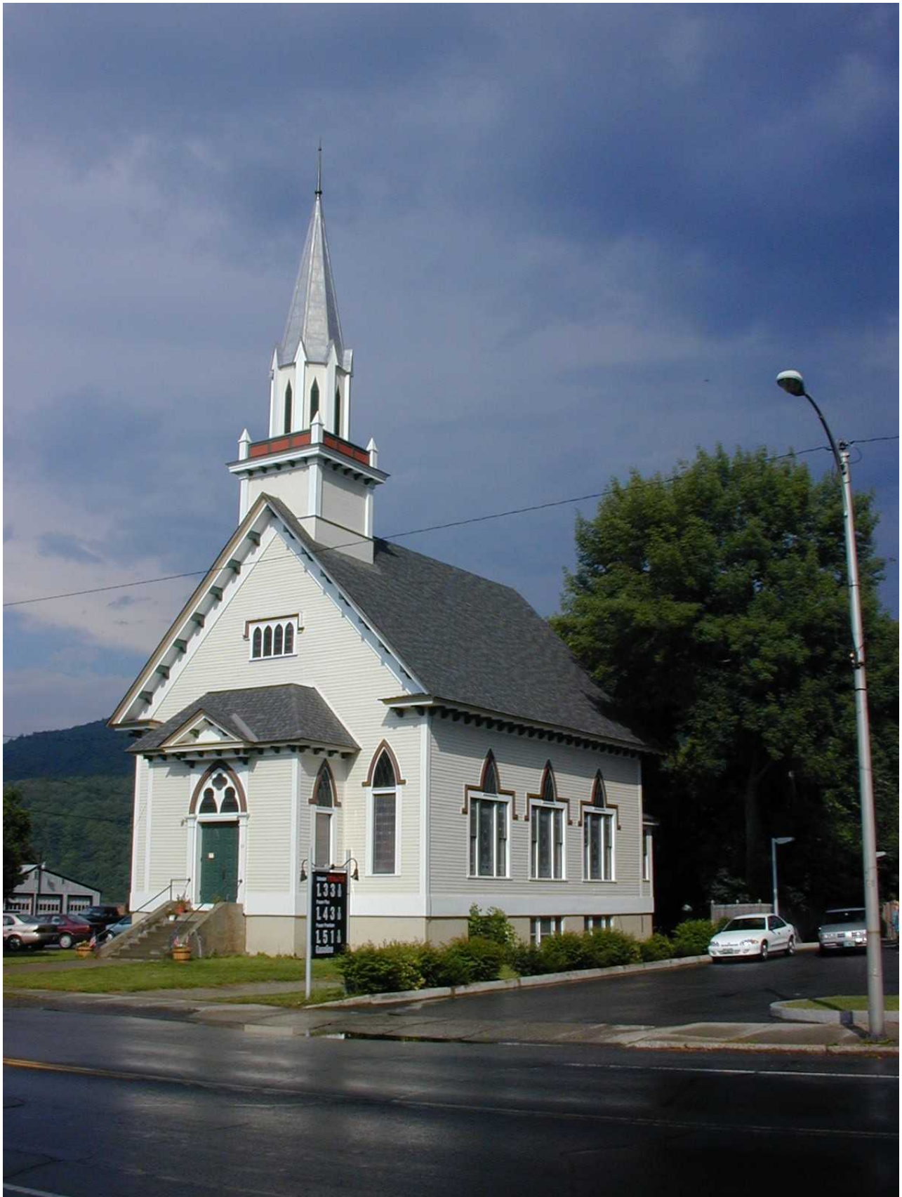
Church following repair, Windsor, Vermont, July 2002.