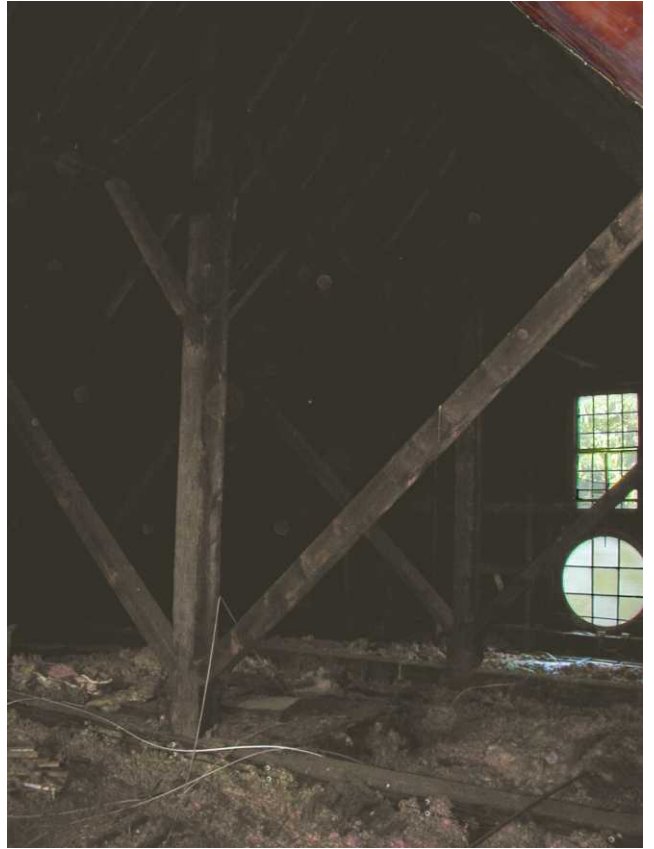
Church interior and attic, Windsor, Vermont.