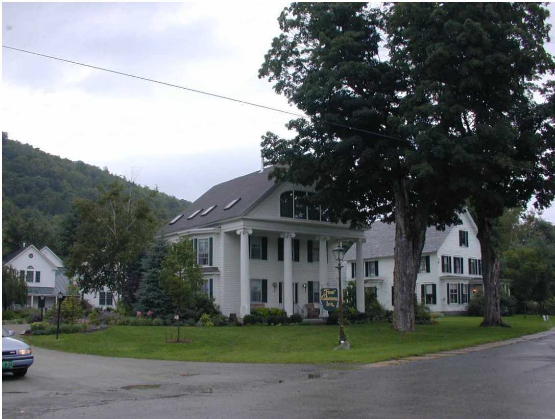
New Fane Courthouse (1824) and Four Columns Inn (Pardon-Kimball house).